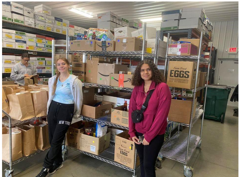
Dedicated Volunteers in the Warehouse

335 families signed up for assistance, 73 more than last year. After the distribution day, families could come get their food up until Thanksgiving. There were 44 families who never came.